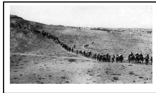
Armenian Death Walk in Syrian Desert

Adults $7; 60+ Seniors & Military $6; Students – No Cost